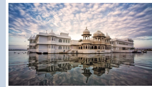
LAKE PALACE UDAIPUR