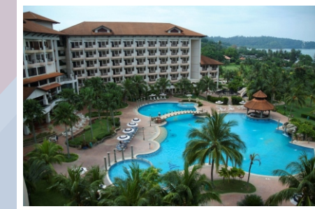
THISTLE RESORT, MALAYSIA