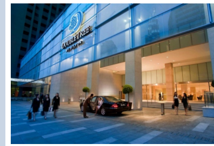
DOUBLE TREE BY HILTON, KUALA LUMPUR