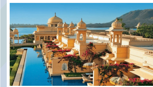
THE OBEROI UDAIVILAS UDAIPUR