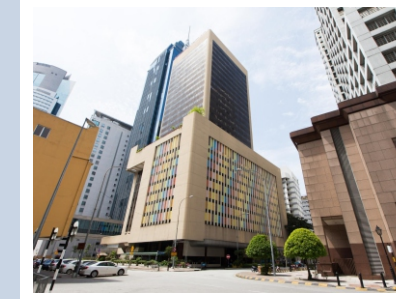
GRAND SEASON, KUALA LUMPUR